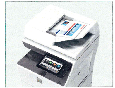
Sharp's ImageSEND™ feature provides one-touch distribution to email cloud applications and more.